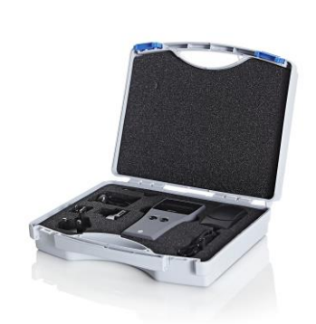
Protective Carry case