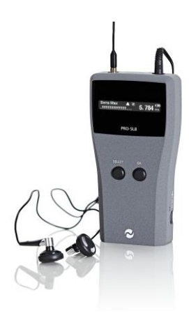
PRO-SL8 with earphones